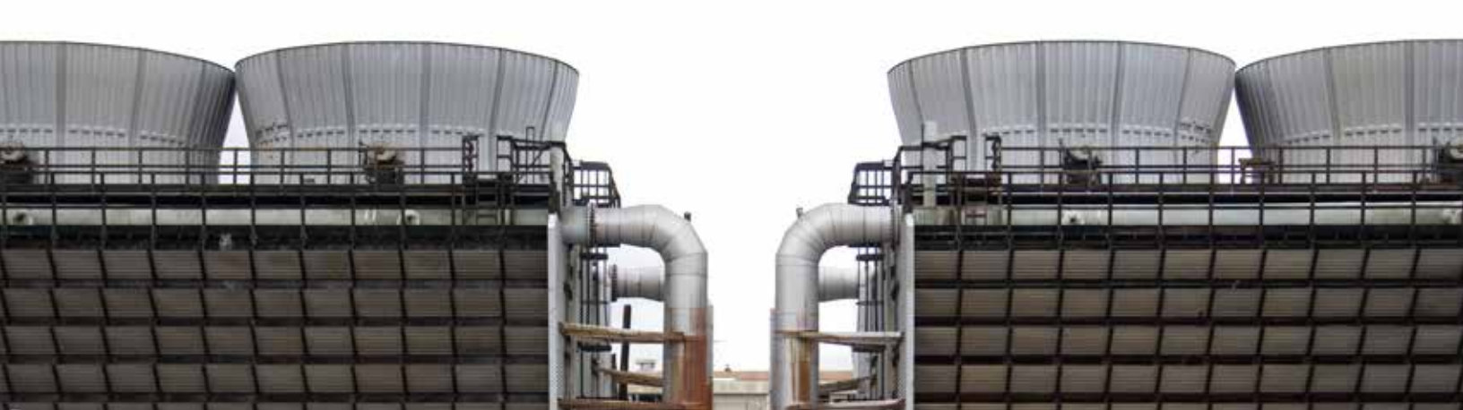
Rexnord Addax Composite Couplings

Rexnord Addax Composite Couplings are ideal for cooling tower applications. The composite material offers superior corrosion resistance and minimal thermal expansion relative to steel shafts. Additionally, these couplings feature a lighter weight for ease of installation. A mechanical brake is also available to eliminate potentially hazardous shaft rotation during maintenance.