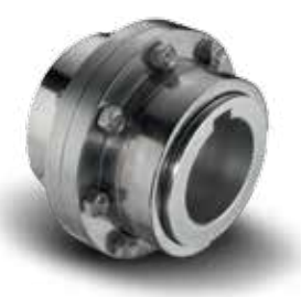
Falk Lifelign Gear Couplings