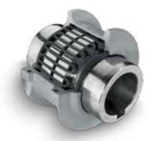
Falk Steelflex Grid Couplings