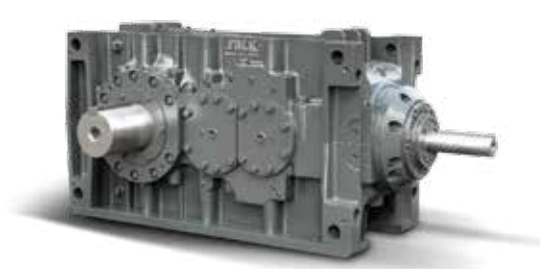
Falk V-Class Gear Drives

Rexnord is a leader in the engineered gearboxes and couplings used to drive large slurry pumps. Engineered gearboxes designed for durability, and couplings designed to absorb vibration and axial movements, provide a more robust solution than belt and sheave alternatives.